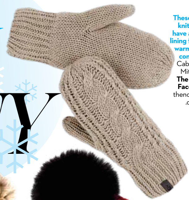
These cable-knit mitts have a fleece lining for extra warmth and comfort. Cable Knit Mittens, The North Face , $45; thenorthface.com