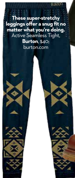
These super-stretchy leggings offer a snug fit no matter what you're doing. Active Seamless Tight, Burton , $40; burton.com