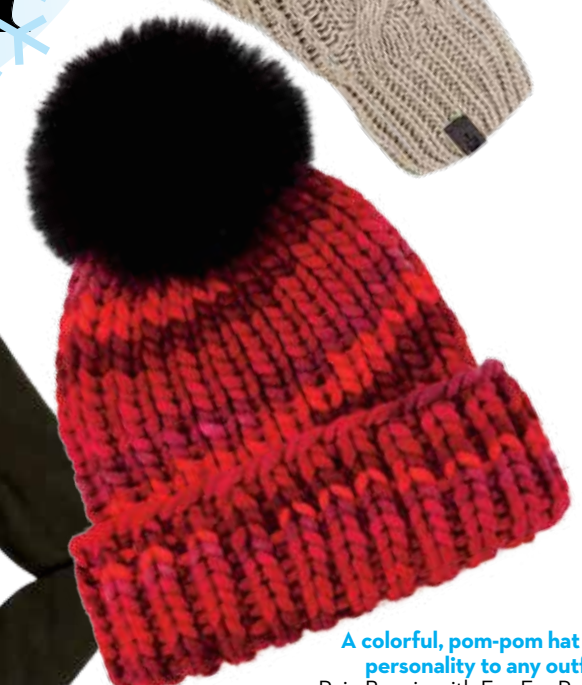
A colorful, pom-pom hat adds personality to any outfit. Rain Beanie with Fox Fur Pom-Pom, Eugenia Kim , $250; bergdorfgoodman.com