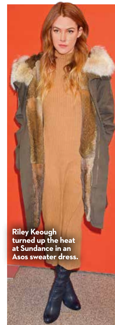
Riley Keough turned up the heat at Sundance in an Asos sweater dress.