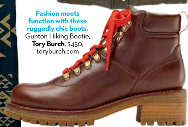
Fashion meets function with these ruggedly chic boots. Gunton Hiking Bootie, Tory Burch , $450; toryburch.com