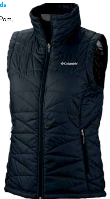
A lightweight vest with reflective lining boosts heat retention without adding bulk. Mighty Lite III Vest, Columbia , $90; columbia.com