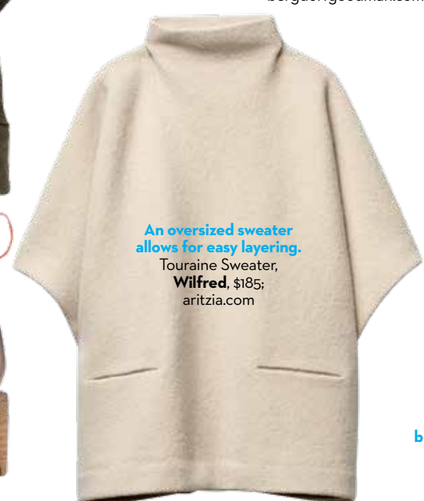
An oversized sweater allows for easy layering. Touraine Sweater, Wilfred , $185; aritzia.com