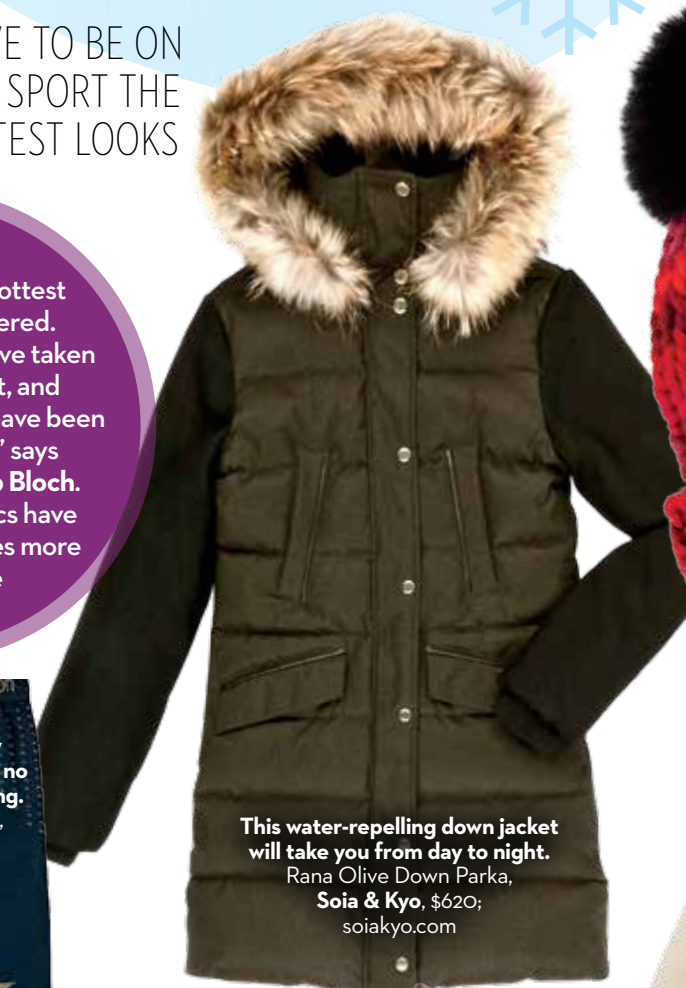
This water-repelling down jacket will take you from day to night. Rana Olive Down Parka, Soia & Kyo , $620; soiakyo.com