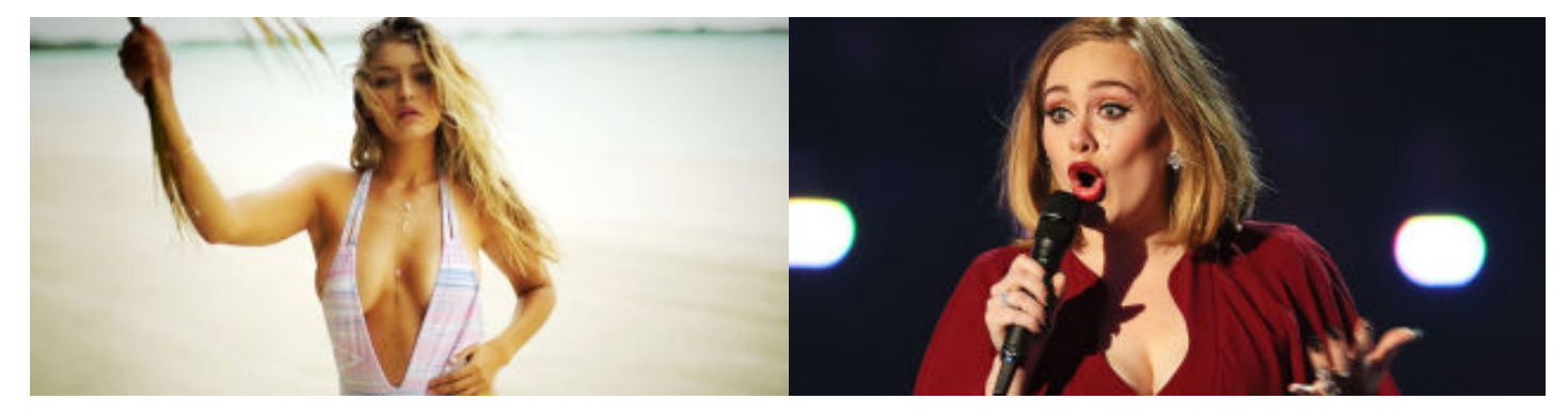
GIGI HADID WEARS THE TEENIEST LEAST FUNCTIONAL BIKINIS IN SPORTS ILLUSTRATED'S SWIMSUIT ISSUE