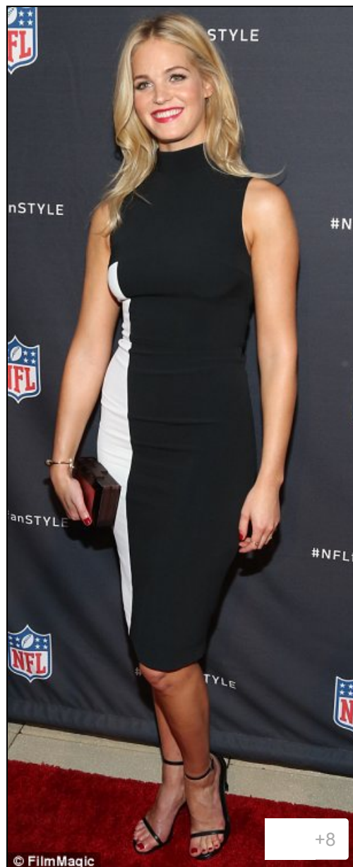
Monochrome marvel: Erin Heatherton wore a black and white dress and Rauwolf clutch, but revealed she supports the Chicago Bears

Meanwhile American Idol alum Jordin has been dating Jason Derulo for over two years, and he even wrote the song Marry Me for her.