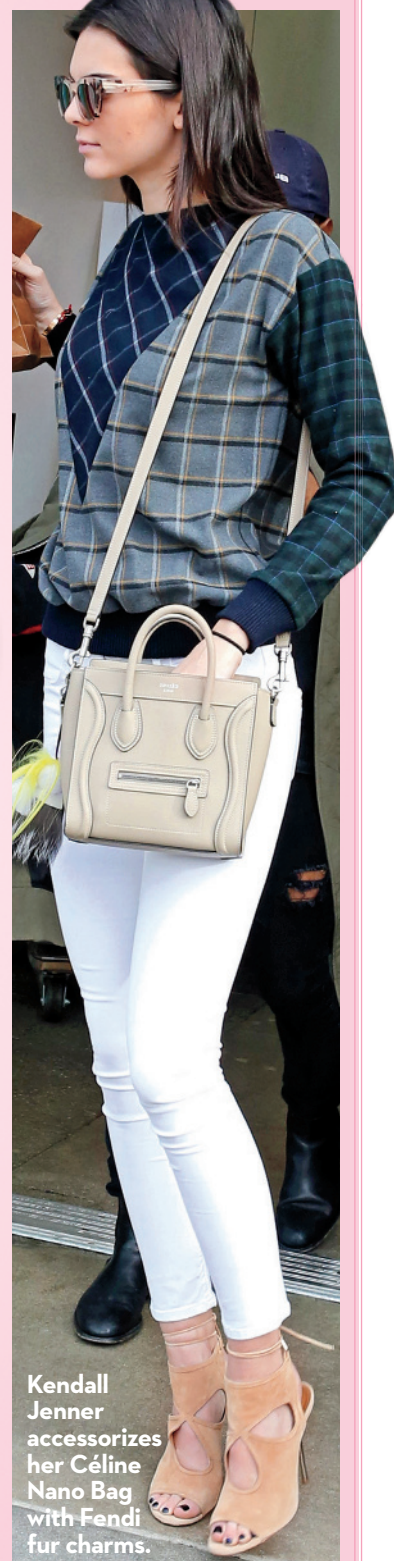
Kendall Jenner accessorizes her Céline Nano Bag with Fendi fur charms.

Cara Delevingne has already been spotted toting this spring 2015 Burberry satchel. Mini Bee, Burberry , $2,795; burberry.com